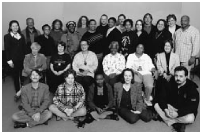
Central Region (Bristol, Hartford, New Britain, Waterbury) Participants

Continuing Education Opportunities Through continuing education and other professional development, we provide opportunities for participants to attend local, regional and national conferences including: the New England Artists Trust Congress, New England Foundation for the Arts-sponsored conferences, National Assembly of State Arts Agencies, International Sculpture Center – Sculpture 2000 Conference, The Association of American Cultures, People's Poetry Festival, and other local conferences. In addition, we have established a 12-month residency partnership with the Farmington Valley Arts Center. We also provide funding for artists to attend other residencies for literary and visual artists in Vermont, New York, Massachusetts and Connecticut. Participants