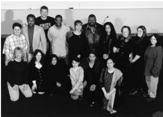
Southwest Region (Bridgeport, New Haven, Norwalk, Stamford) Participants