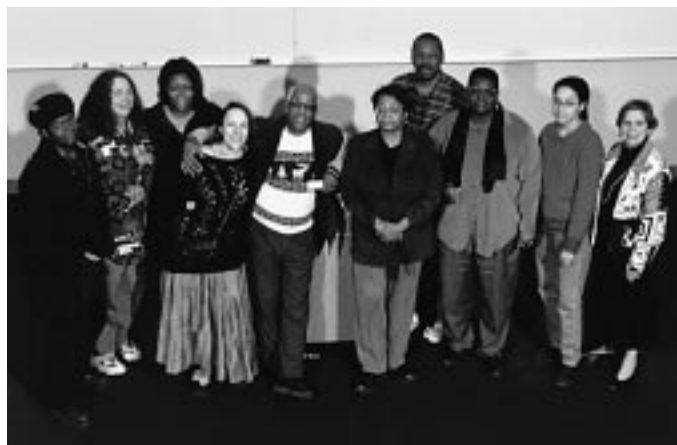
New Haven ICCD Participants (Arts Council of Greater New Haven)